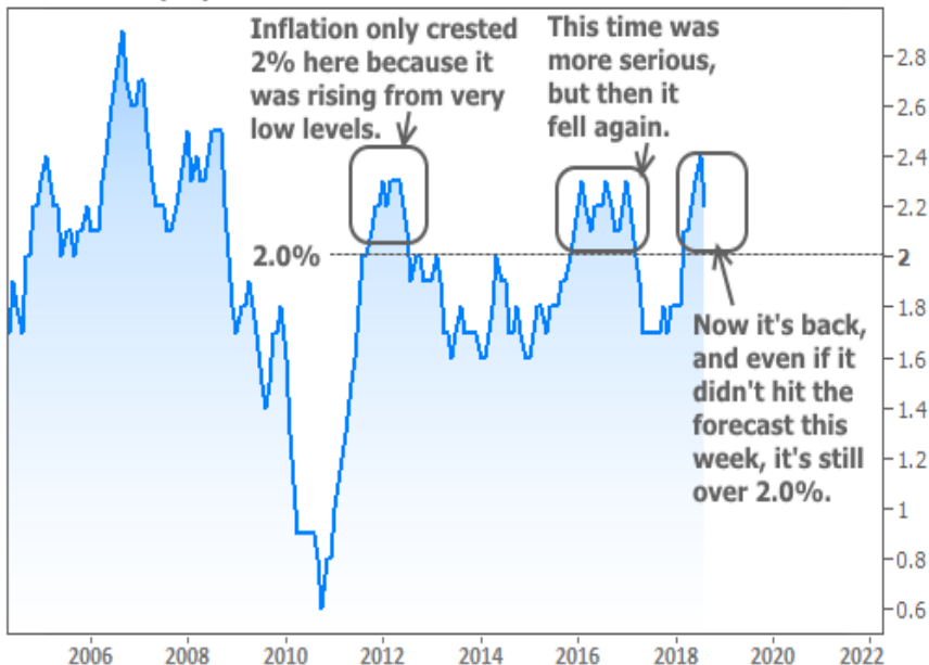
Core Inflation (CPI)

Some of the economic data (like consumer sentiment), far exceeded forecasts while other data (like Retail Sales) came up a bit short. Forecasts aside, both sets of data suggest August was just another month with the overall economy firing on all cylinders.