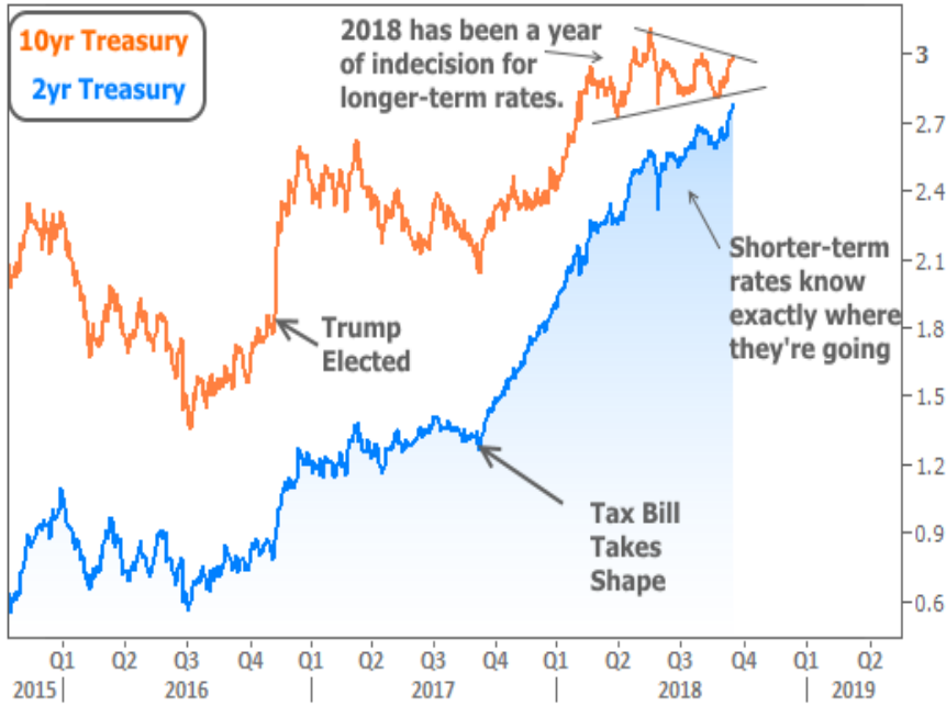
Longer vs Shorter Term Rates