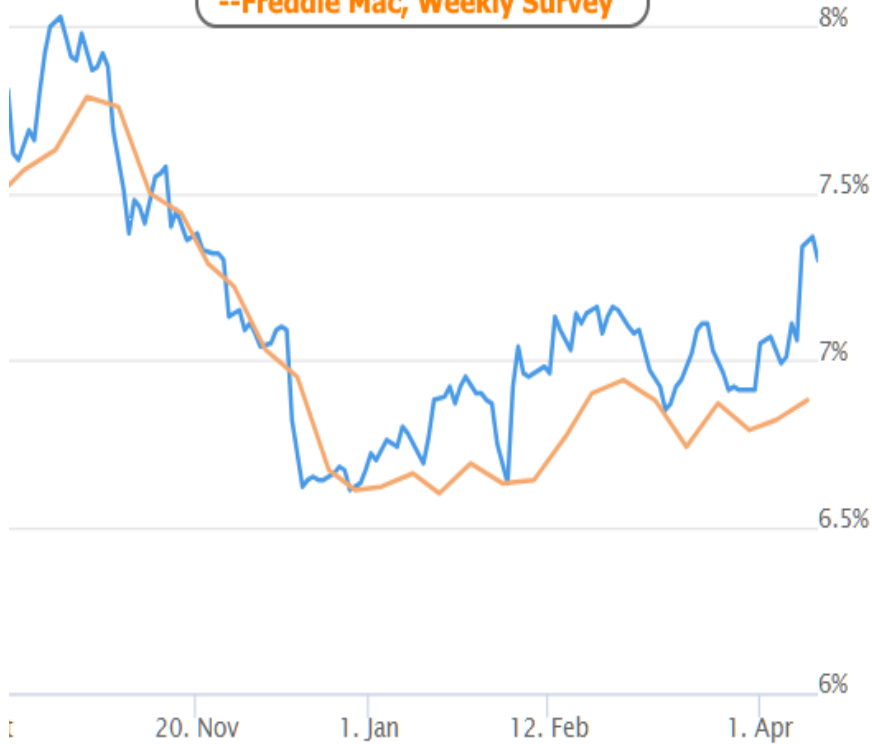
Mortgage Rate Indices --MND, Actual Daily Average --Freddie Mac, Weekly Survey

Why did we see such a big reaction for such a small deviation in the data? Simply put, the market keeps waiting for a trend toward lower inflation to resume and the data keeps breaking hearts. This week's report was sort of a "third times the charm" moment. Jan and Feb CPI (released in Feb and Mar, respectively) were also surprisingly high. They did damage to rates to be sure, but markets and even officials from the Federal Reserve were hoping those reports were outliers.