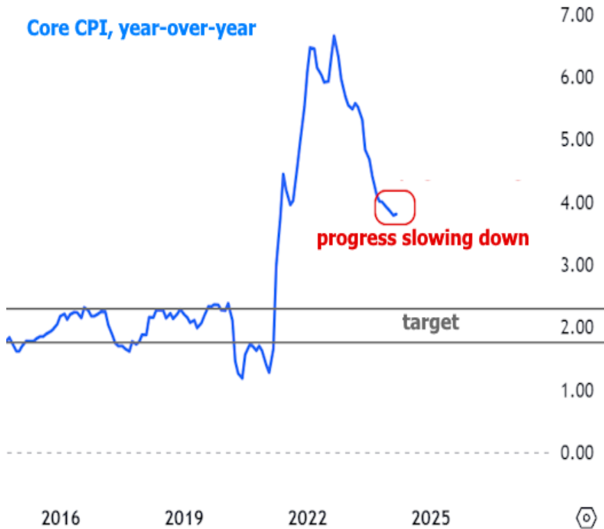
Core CPI, year-over-year

The Fed continues to remind the market that inflation progress is a bumpy road and that these recent setbacks aren't necessarily evidence of defeat. After all, the year over year trend still looks OK despite leveling off a bit from its previous trajectory.