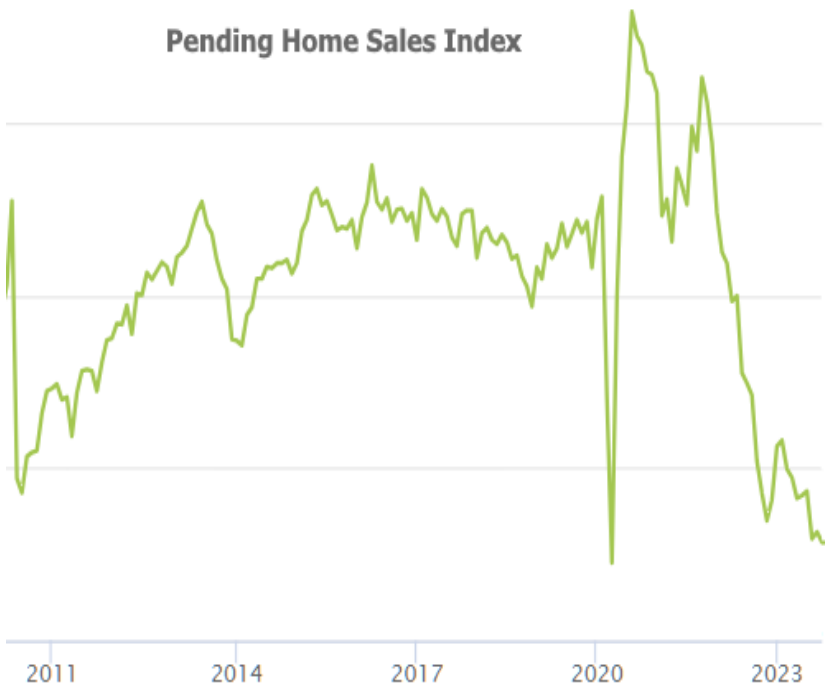
Pending Home Sales Index

It's a similar story for interest rates. 2022 was marked by the largest change in mortgage rates in a single year since 1981, but 2023 took the outright levels just a bit higher.