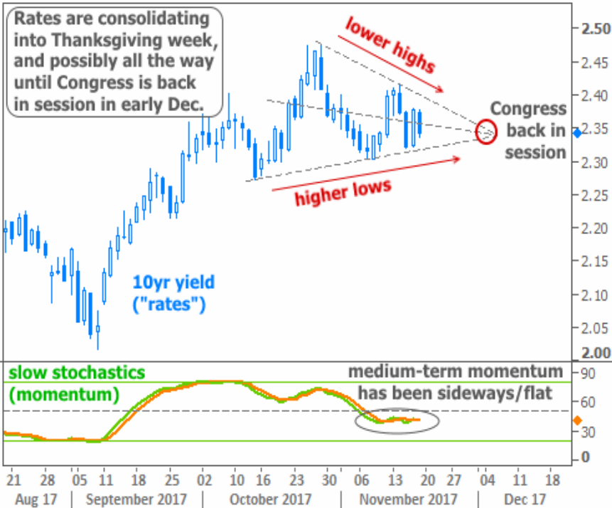
US 10yr Treasury Yield

In the spirit of "waiting and seeing," interest rates improved slightly this week. This keeps them locked in a consolidative trend (higher lows and lower highs) that's been underway for more than a month. It's the bond market's way of expressing indecision, and for now, the trend suggests indecision could linger at least through early December. Even if we apply some esoteric math to recent rate movement and derive a line that measures momentum, that line has been almost perfectly flat for several weeks.