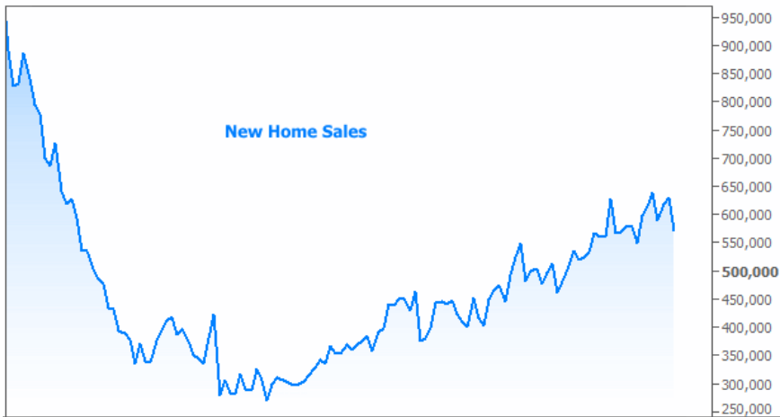
New Home Sales

Sales of newly constructed homes in July are estimated at a seasonally adjusted annual rate of 571,000 units. This is down 9.4 percent from June and 8.9 percent from the estimate for July 2016. The bad news was mitigated a bit as the U.S. Census Bureau and the Department of Housing and Urban Development revised their earlier June estimate to 630,000 units from their original estimate of 610,000.