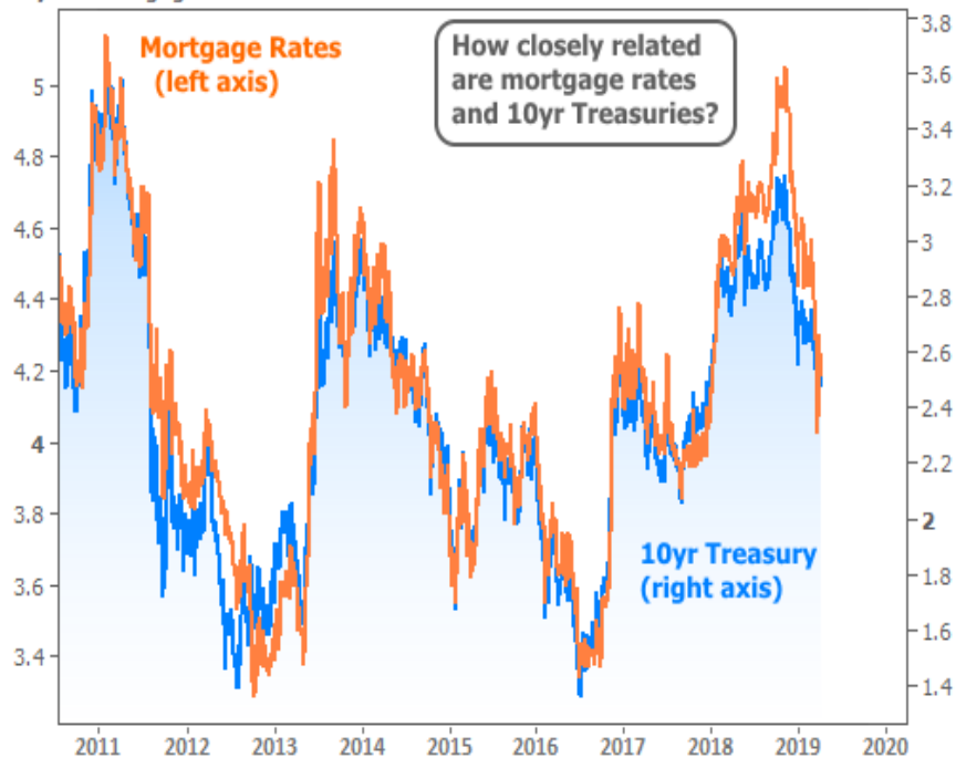
10yr vs Mortgage Rates

Clearly, 10yr Treasury yield movement is exceedingly relevant to mortgage rates. Treasuries are much more liquid, much more actively traded, and do a much better job of capturing the market's every little hope and concern. Simply put, they're what you want to follow if you want the maximum amount of information about longer-term rates.