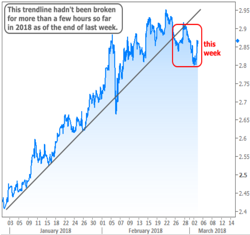
US 10yr Yield ("rates")