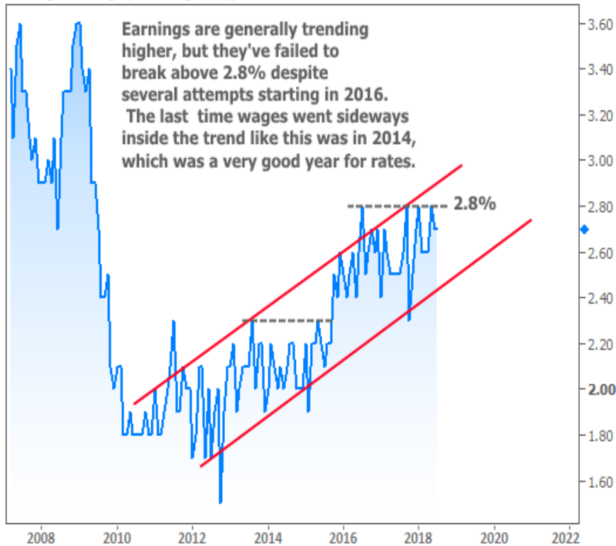
Average Earnings (% Change, y/y)

OK, maybe we should move on. You said something about home sales and glimmers of hope?