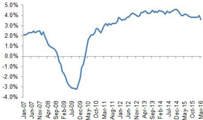
Figure 1: Single-Family Rental Index: Rent Growth Flattens Percent Change from Year Ago