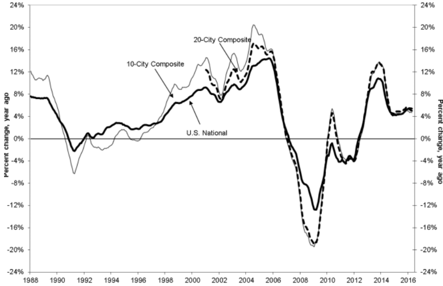
S&P/Case-Shiller Home Price Indices

Source: S&P Dow Jones Indices & CoreLogic