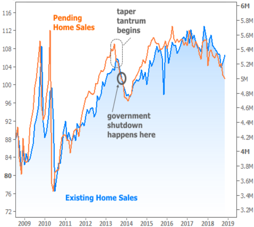
Pending and existing home sales

In the current case, things are a bit different. This time around the government shutdown hit during a fairly decent recovery in interest rates. It will give us a much better chance to see which one matters more. The only catch is that housing sales numbers for the time frame of the shutdown won't be out until later this month, and the most meaningful numbers won't be out until February or March.