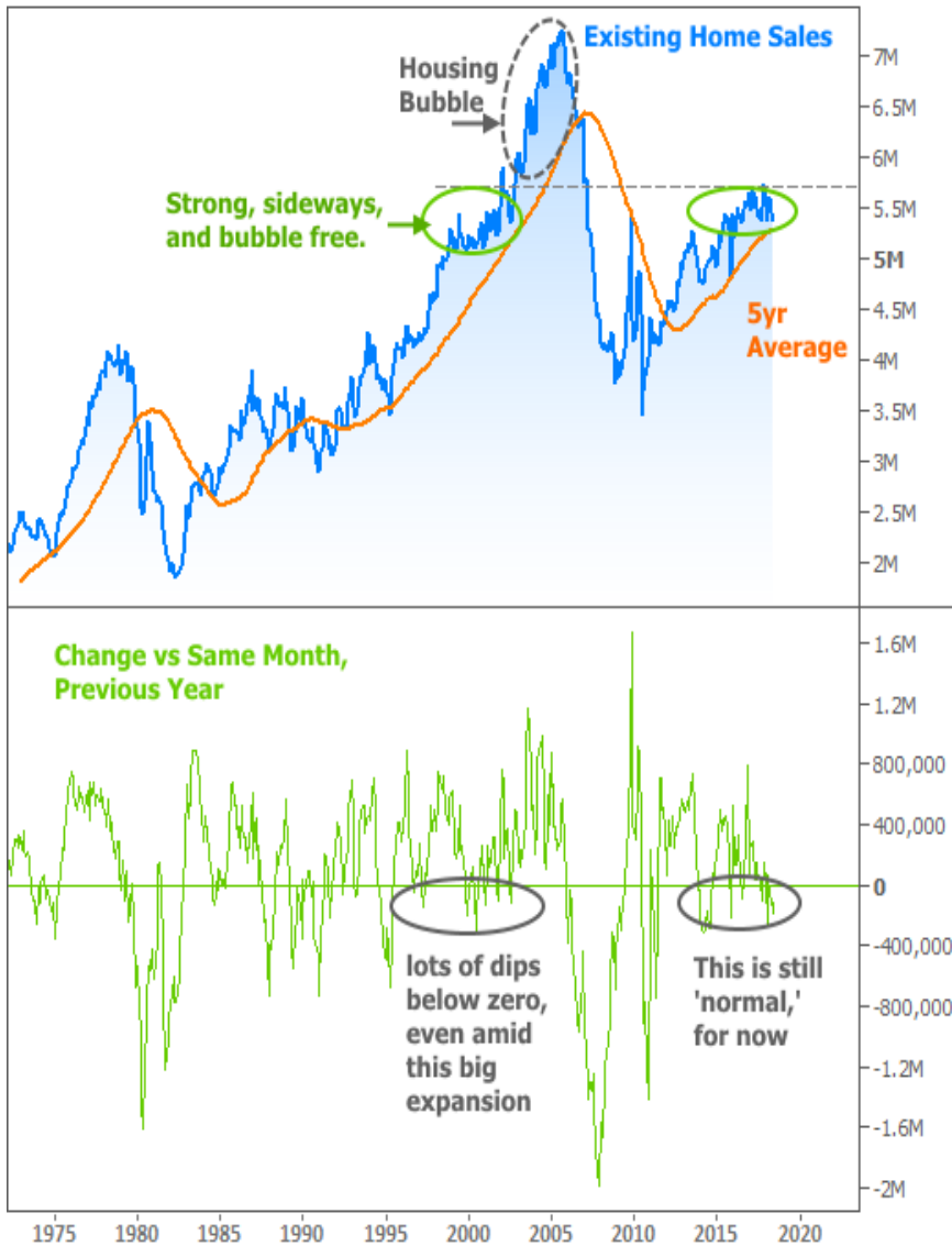
Existing Home Sales

Whereas it might require a deep breath and some perspective to feel optimistic about existing sales, New Home Sales are still very clearly in a linear uptrend. They just happen to be experiencing a move lower INSIDE that trend--one that they've seen at least 4 times in the past 5 years. In fact, the periodic corrections of the past few years are clearly milder than those seen during the previous expansion (as seen at the bottom of the following chart).