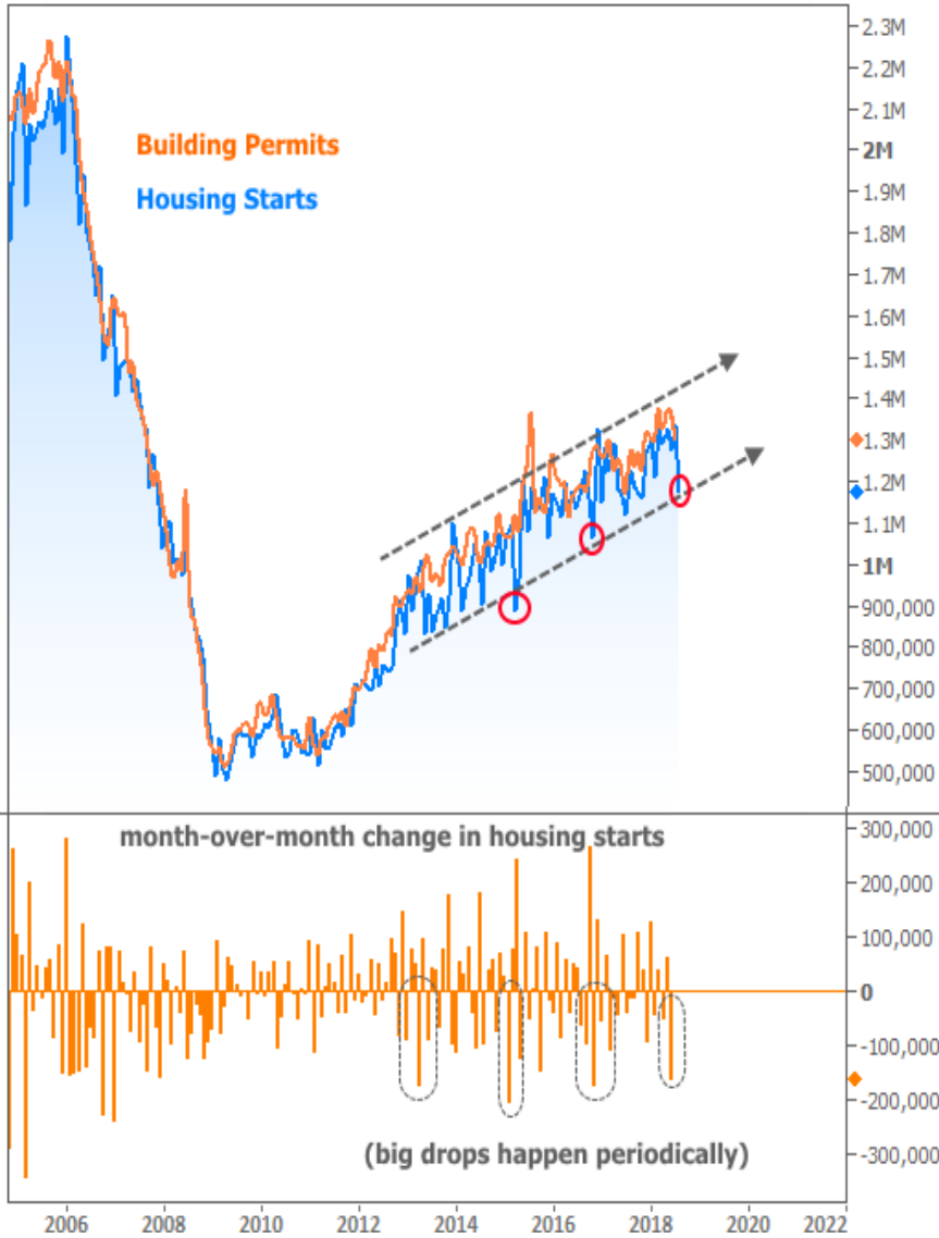
Starts vs Permits

Big drops in housing starts happen from time to time. And despite this particular drop, a positive trend remains intact.