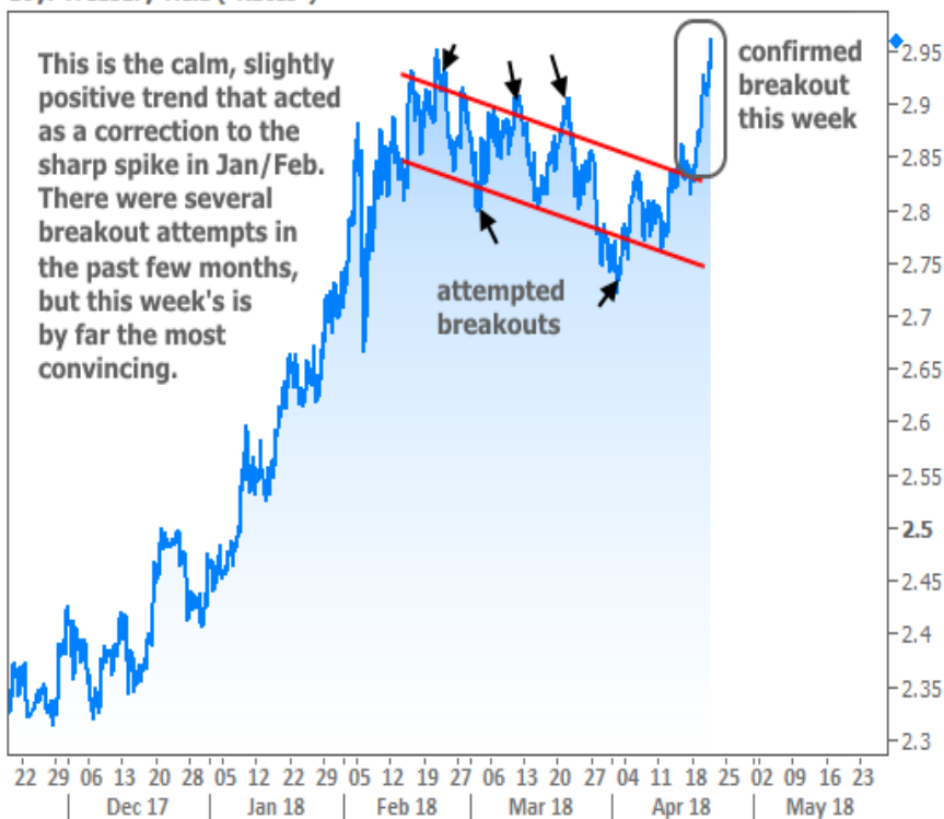
10yr Treasury Yield ("Rates")

This old wolf not only gets a bad rap, but he also gets more credit than he deserves . Rate spikes like this are simultaneously feared as a negative indicator for housing and blamed for spooking the stock market. A housing hit seems logical enough. After all, rates affect affordability. But in reality, none of the ups and downs in rates over the past few years have had commensurate impacts on housing numbers.