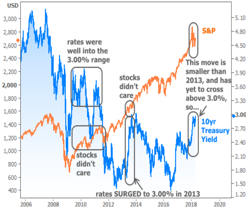
Stocks vs Bonds

How about the stock market? It was fairly tough to tune-in to financial news this week without seeing the rate spike being blamed for slumping stocks. Rather than bore you with words, I'll just leave the following chart right here ( conclusion: stocks didn't care about 3% 10yr Treasury yields in the past, nor did they care about a much bigger rate spike in 2013):