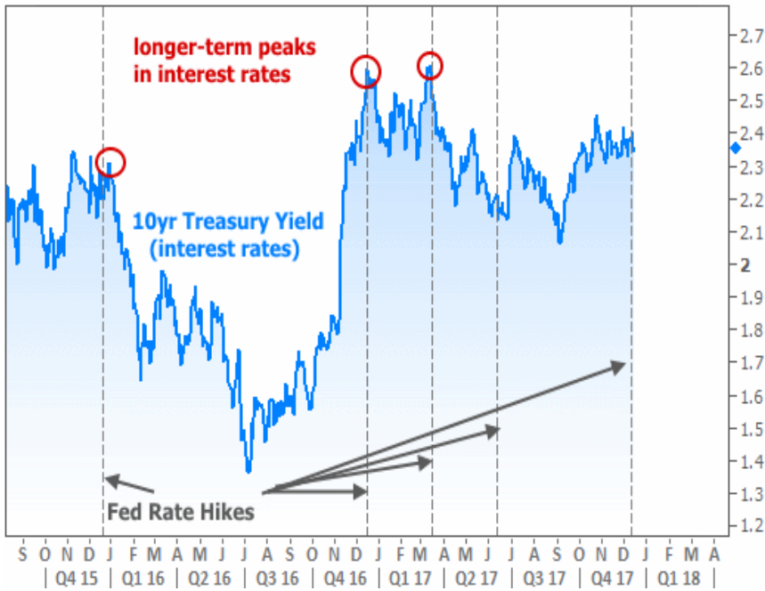
Rates and Rate Hikes

Other parts of this week's Fed communications were still important , but they actually helped rates move LOWER. Chief among these were the Fed's economic projections .