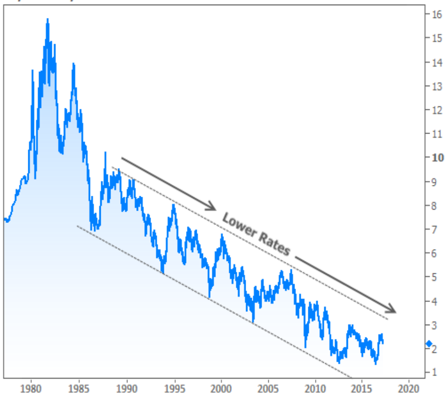
10yr Treasury Yield

Combined with specific expectations for tax reform, the Trump trade was clear : buy stocks and sell bonds (which pushes rates higher). And that's exactly what happened after the election. Moreover, pundit after pundit proclaimed the death of the decades-long trend toward lower rates. This is how that trend looks in terms of 10yr Treasury yields--the quintessential benchmark for longer-term rates (like mortgages):