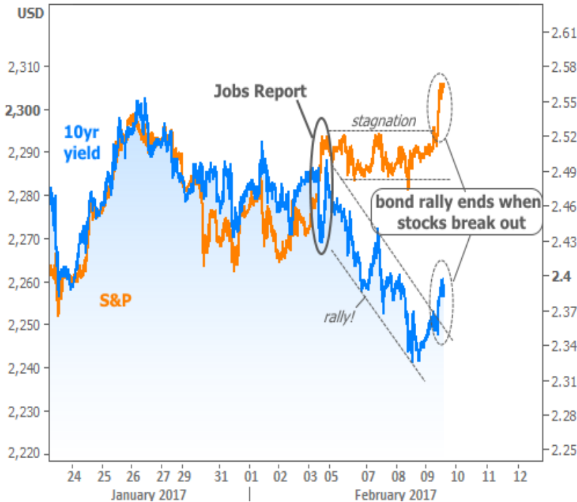
Stocks vs Bonds

Even though the previous chart highlights a potential connection between stocks and bonds, there are other, simpler ways to explain the recent movement. They go back to the notion of "waiting," and they're just as valid as any other explanation.