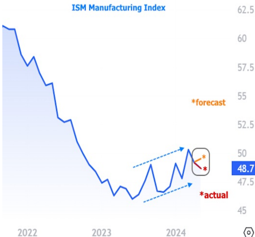
ISM Manufacturing Index

In fact, the size of the reaction to Monday's ISM data is one of the best reasons to investigate other variables. These could include follow-through momentum from last Friday's rate-friendly reaction to the PCE inflation data as well as more esoteric motivations surrounding the change of one calendar