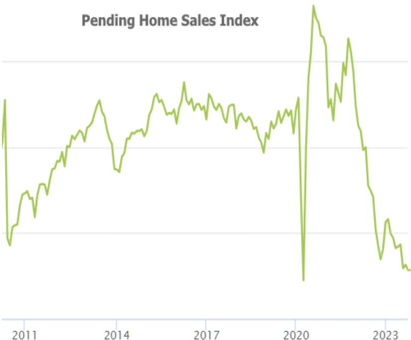
Pending Home Sales Index

It's a similar story for interest rates. 2022 was marked by the largest change in mortgage rates in a single year since 1981, but 2023 took the outright levels just a bit higher.