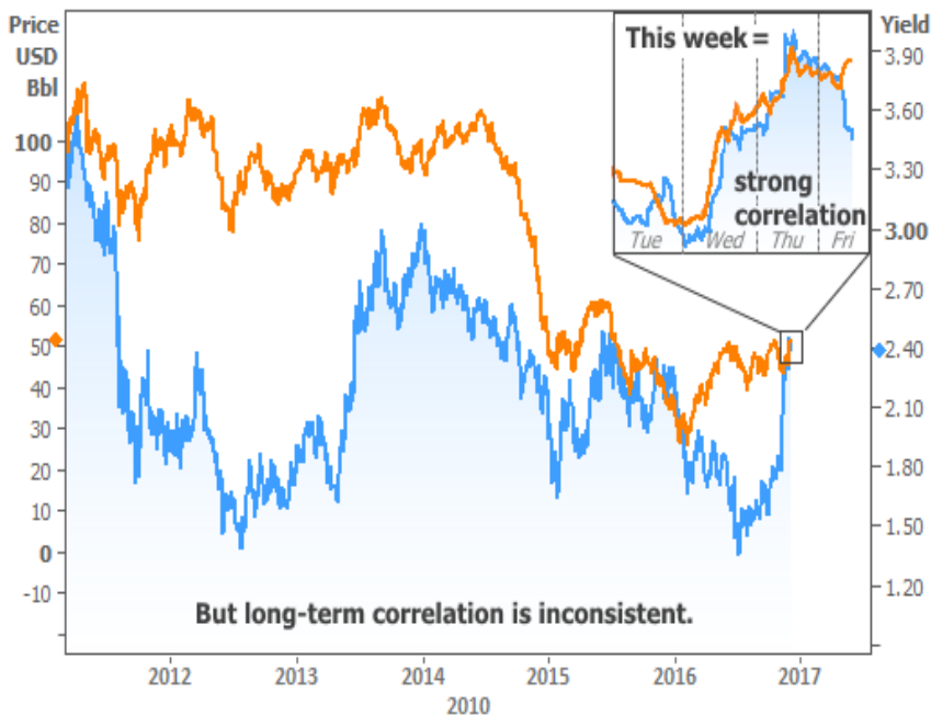
Rates vs Oil

Oil prices do indeed have strong correlations with interest rate movements. This week was a good example of that, as we'll see in the following chart. But the chart also shows that this week's correlation is a small drop in a much bigger bucket.