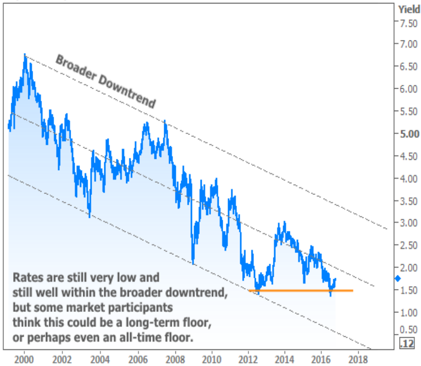
10yr Treasury Yields

Subscribe to my newsletter online at: http://housingnewsletters.com/breton