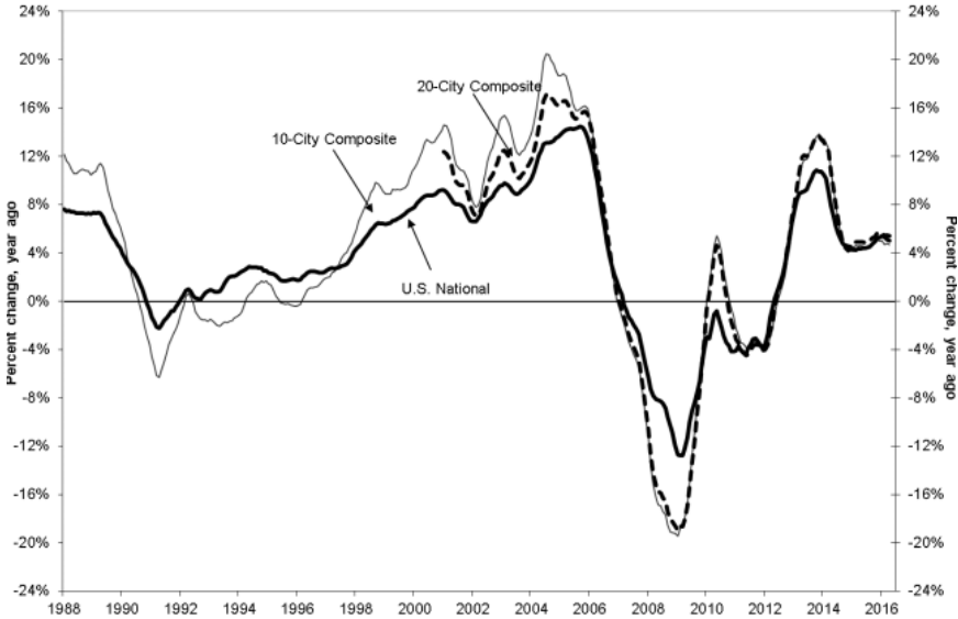
S&P/Case-Shiller Home Price Indices

Source: S&P Dow Jones Indices & CoreLogic