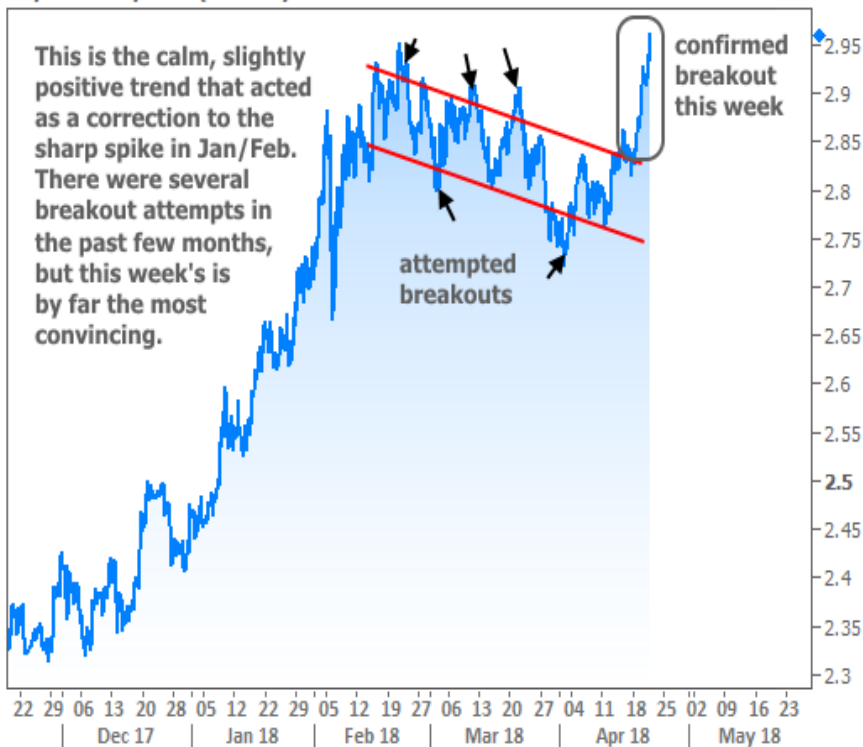
10yr Treasury Yield ("Rates")

This old wolf not only gets a bad rap, but he also gets more credit than he deserves . Rate spikes like this are simultaneously feared as a negative indicator for housing and blamed for spooking the stock market. A housing hit seems logical enough. After all, rates affect affordability. But in reality, none of the ups and downs in rates over the past few years have had commensurate impacts on housing numbers.