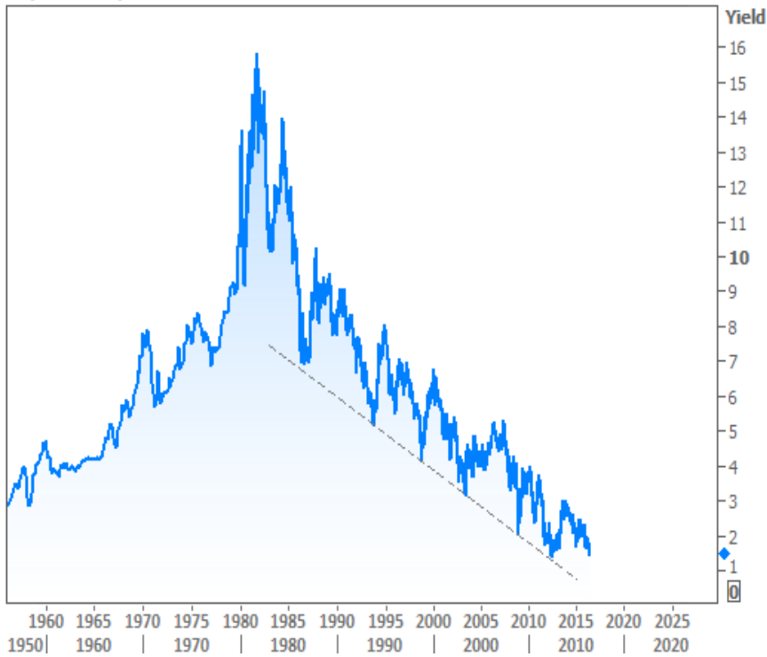
10yr Treasury Yield

Most would assume that falling interest rates have limits and that we'd see those limits the closer we got to zero, but a quick glance at Japanese and European equivalents to the US 10yr yield shows us that "zero" was no deterrent to that downward momentum.