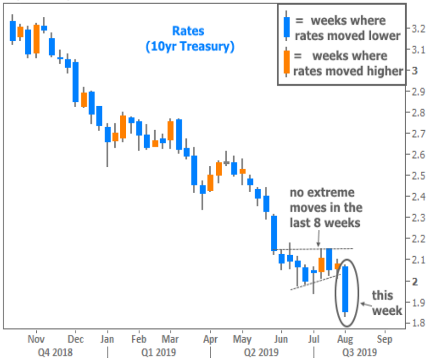
10yr Treasury Yield

Low rates don't singlehandedly prop up the housing market, but they definitely help. That was part of the rationale in last week's newsletter which pushed back on recent news headlines calling the health of the housing market into question (revisit it HERE if you like). Now this week, we have the most recent Pending Home Sales report, which is an advance indicator of Existing Home Sales--by far the biggest component of the housing market. I'll let the chart do most of the talking. Let's just say, if you're a regular reader of my newsletters, this is exactly how this summer was supposed to go.