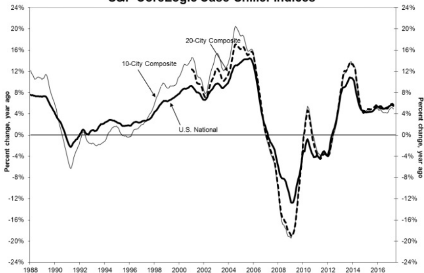
S&P CoreLogic Case-Shiller Indices

Sources: S&P Dow Jones Indices & CoreLogic