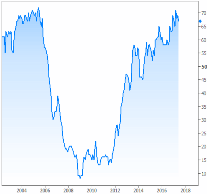
NAHB Housing Market Index

It's harder to offer a compelling counterpoint for Friday's New Residential Construction data from the Census Bureau. Both Housing Starts and Builder Permits came in well below forecasts, prompting National Association of Realtors' Chief Economist to say "housing shortages look to intensify and may well turn into a housing emergency if the discrepancy between housing demand and housing supply widens further."