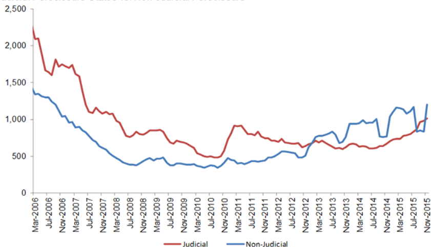
Figure 1 – Number of Mortgaged Homes per Completed Foreclosure Judicial Foreclosure States vs. Non-Judicial Foreclosure

The number of completed foreclosures nationwide in November was down to about 30 percent of the level in the worst days of the housing crisis. CoreLogic's monthly National Foreclosure Report puts completed foreclosures in November at 33,000 compared to 117,657 in September 2010. The November number is down 21.8 percent from November 2014 and is 10.9 fewer than the 38,000 completed foreclosures in October 2015. As a basis of comparison, between 2000 and 2006 completed foreclosures averaged 21,000 per month nationwide.