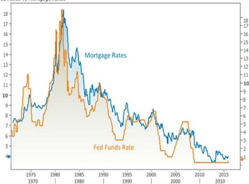
Fed Funds vs Mortgage Rates

What the chart DOESN'T show —at least not as obviously—are the subtleties that help brighten the outlook. First of all, notice the last Fed hike in 2004. At the time, mortgage rates actually moved slightly lower just after the Fed raised rates. The reasons for that are similar to the present-day reasons.