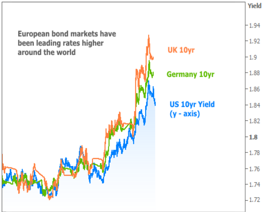
10yr Bond Yields