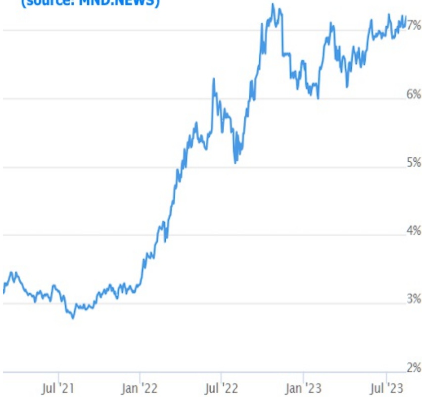
30yr fixed mortgage rate index

This is the new and persistent reality until one of 3 things happens: