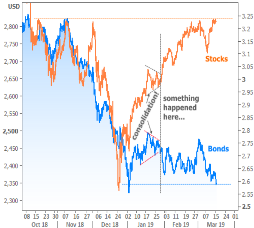
Rates vs Stocks

No, the Fed isn't getting ready to unveil another quantitative easing (QE) package, at least not directly. Indirectly, however, markets are about to feel the same sort of QE-driven euphoria. In fact, they've been feeling it for a few months now.