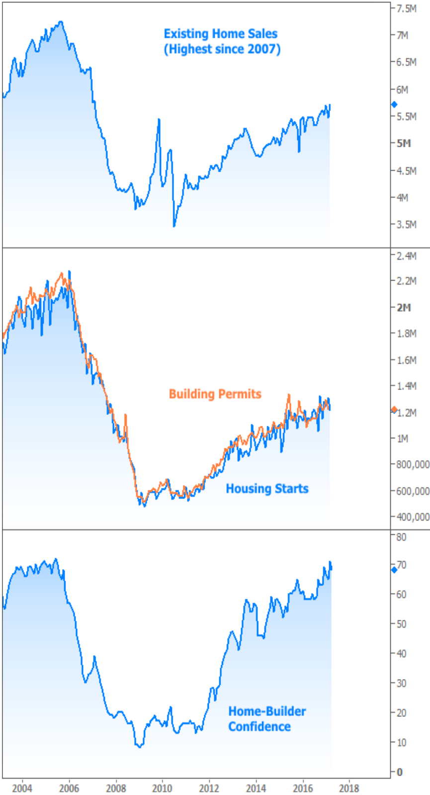
This Week's Housing Data