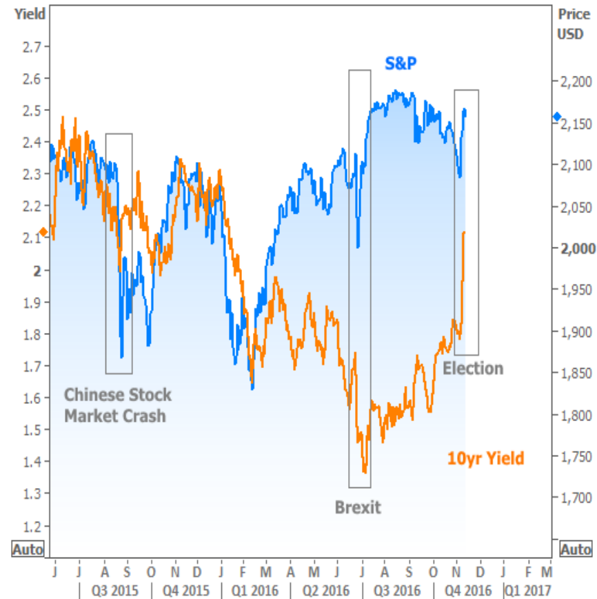
Stocks vs Bonds

By a decisive margin, the last 2 days of this week were the worst 2 days for rates since the taper tantrum in June 2013. The existing uptrend in rates was completely shattered, and history suggests there's still a chance of more pain ahead.