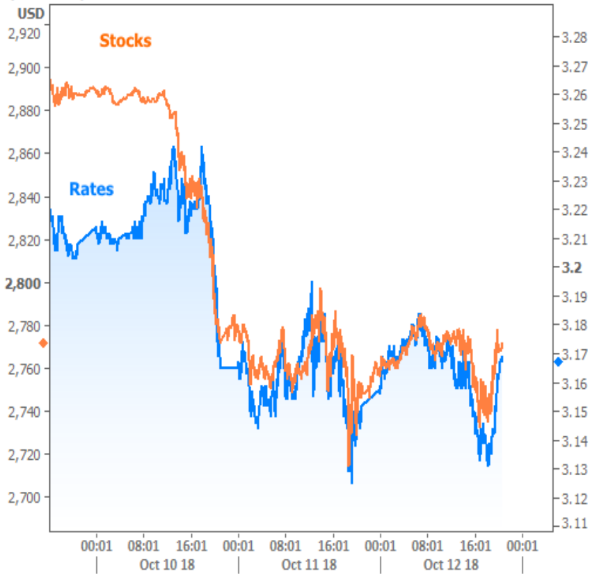
10yr Treasury Yield vs Stocks

The net effect was that mortgage rates fell back to their lowest levels since last Thursday by the end of the week. You may have seen news stories over the past two days talking about a "sharp move higher" in rates. This has to do with stale underlying data used by many media outlets to write their once-a-week mortgage rate article. The sharp move higher occurred LAST week , as we discussed at the time .