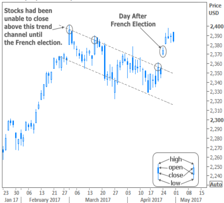
S&amp;P 500 (daily candlesticks)

We might take the stock breakout with a grain of salt for a few reasons. First of all, it's earnings season, which often provides some extra levity. From a technical perspective, the S&P (the index of choice among traders) was unable to break above March 1st's all-time highs. If that ceiling remains intact, stock traders will increasingly think about checking out the lower side of the range. To whatever extent that happens, bond markets would reap some of the benefits of the money flowing out of stocks (more bond buying = lower rates).