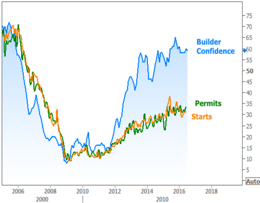
Builder Confidence, Housing Starts, Building Permits

The answer will likely vary depending on your individual outlook on the economy and the housing market. There are several forces at work here. One of the most frequently-cited is that it's simply in builders' best interest to build fewer, bigger houses for economic reasons. The other major consideration is the relative boom in multifamily construction. Both of these would help explain builders' ability to remain much more upbeat than residential construction numbers would suggest.