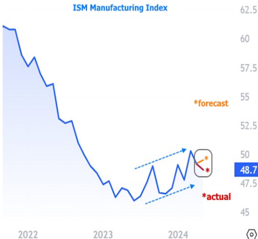
ISM Manufacturing Index

In fact, the size of the reaction to Monday's ISM data is one of the best reasons to investigate other variables. These could include follow-through momentum from last Friday's rate-friendly reaction to the PCE inflation data as well as more esoteric motivations surrounding the change of one calendar