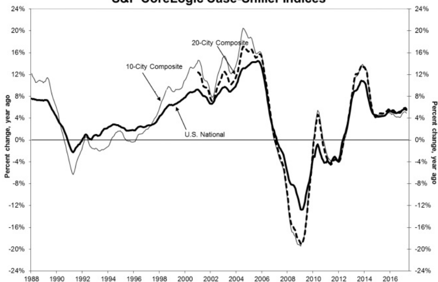
S&P CoreLogic Case-Shiller Indices

Sources: S&P Dow Jones Indices & CoreLogic