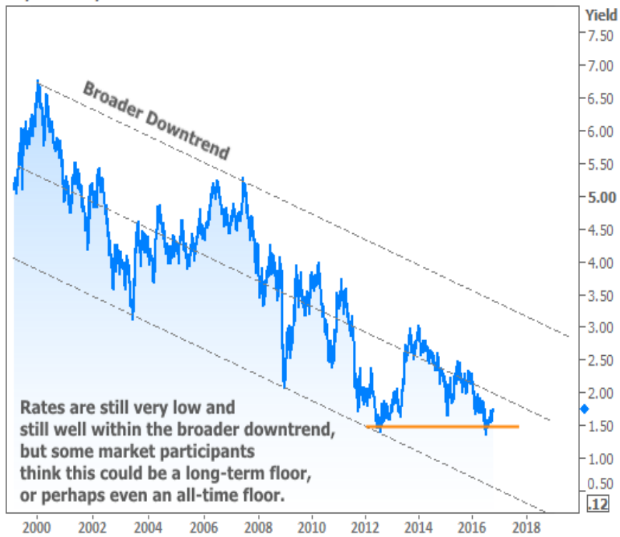
10yr Treasury Yields

Subscribe to my newsletter online at: http://housingnewsletters.com/acfsinc