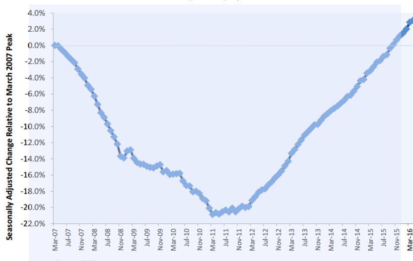
Cumulative Seasonally Adjusted Price Change Relative to the March 2007 Peak for the U.S. Purchase-Only, Seasonally Adjusted Index

For the nine census divisions, seasonally adjusted monthly price changes from March 2016 to April 2016 ranged from -0.7 percent in the Middle Atlantic division to +1.4 percent in the New England division. The 12-month changes were all positive, ranging from +1.7 percent in the Middle Atlantic division to +8.6 percent in the Pacific division.