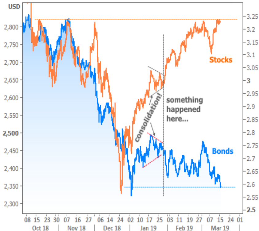
Rates vs Stocks

No, the Fed isn't getting ready to unveil another quantitative easing (QE) package, at least not directly. Indirectly, however, markets are about to feel the same sort of QE-driven euphoria. In fact, they've been feeling it for a few months now.