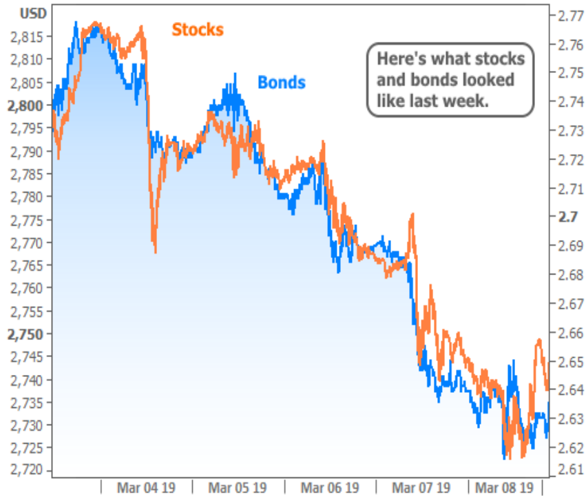
Rates vs Stocks

The next chart will incorporate all of the info above and add the current week to the mix using the same y-axis relationship from last week.