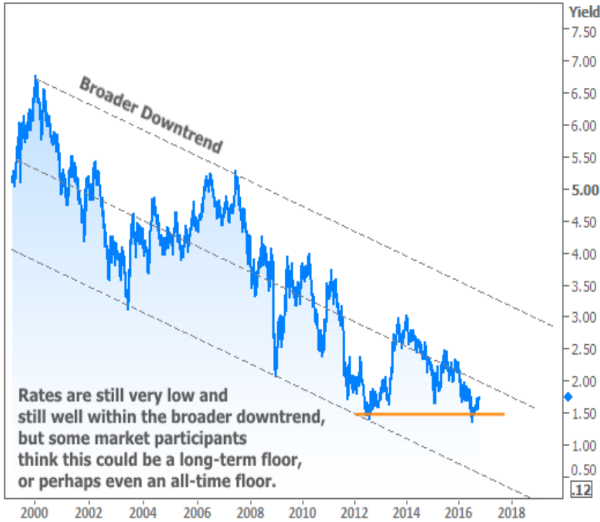
10yr Treasury Yields

Subscribe to my newsletter online at: http://housingnewsletters.com/acfsinc