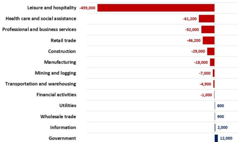
Figure 2. March Employment Changes by Selected Industry (month-over-month change)

Employment in residential construction had been doing well, it was up by 24,100 in February, but that reversed in March, undoubtedly due to impacts from the COVID-19 pandemic , and 4,300 jobs were lost. The total loss across all construction categories was 29,000 jobs. Those losses, however, paled in comparison to the massive ones in the leisure and hospitality industry as hotels shut down, restaurants closed, and cruises were cancelled. Three other job categories also pulled back more dramatically than construction.