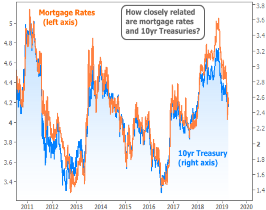
10yr vs Mortgage Rates

Clearly, 10yr Treasury yield movement is exceedingly relevant to mortgage rates. Treasuries are much more liquid, much more actively traded, and do a much better job of capturing the market's every little hope and concern. Simply put, they're what you want to follow if you want the maximum amount of information about longer-term rates.