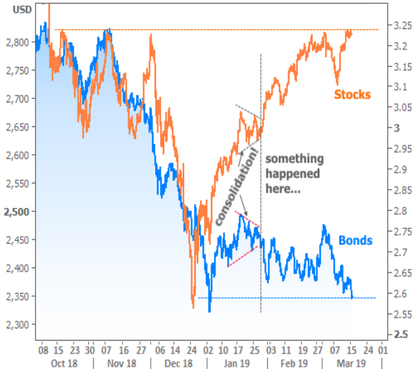
Rates vs Stocks

No, the Fed isn't getting ready to unveil another quantitative easing (QE) package, at least not directly. Indirectly, however, markets are about to feel the same sort of QE-driven euphoria. In fact, they've been feeling it for a few months now.