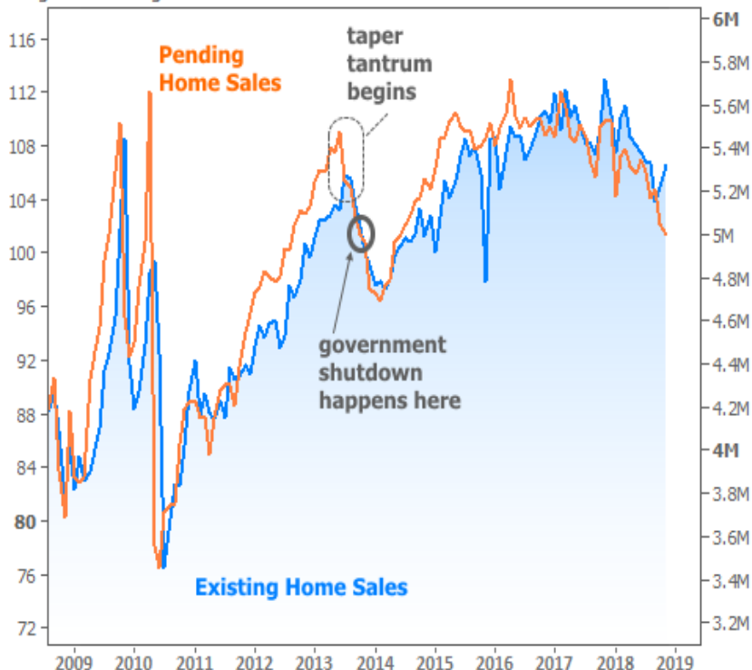
Pending and existing home sales

In the current case, things are a bit different. This time around the government shutdown hit during a fairly decent recovery in interest rates. It will give us a much better chance to see which one matters more. The only catch is that housing sales numbers for the time frame of the shutdown won't be out until later this month, and the most meaningful numbers won't be out until February or March.