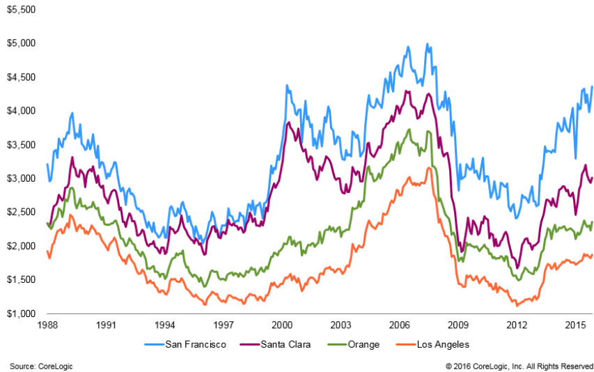
Figure 3: Inflation-Adjusted "Typical" Mortgage Payment for Selected California Counties

LePage also looked at 11 metro areas and found typical mortgage payments to be 20 to 50 percent below peak levels in prior cycles. In metro Dallas the median sales price hit a new peak of $252,000 but the mortgage payment in September was 24 percent below the peak reached in the spring of 2015. In New York the median home price was still 11 percent off of the area's peak but the typical mortgage payment was 42 percent lower.