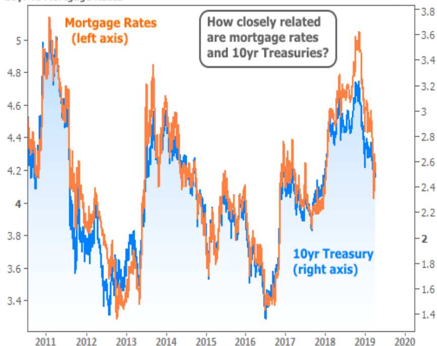
10yr vs Mortgage Rates

Clearly, 10yr Treasury yield movement is exceedingly relevant to mortgage rates. Treasuries are much more liquid, much more actively traded, and do a much better job of capturing the market's every little hope and concern. Simply put, they're what you want to follow if you want the maximum amount of information about longer-term rates.