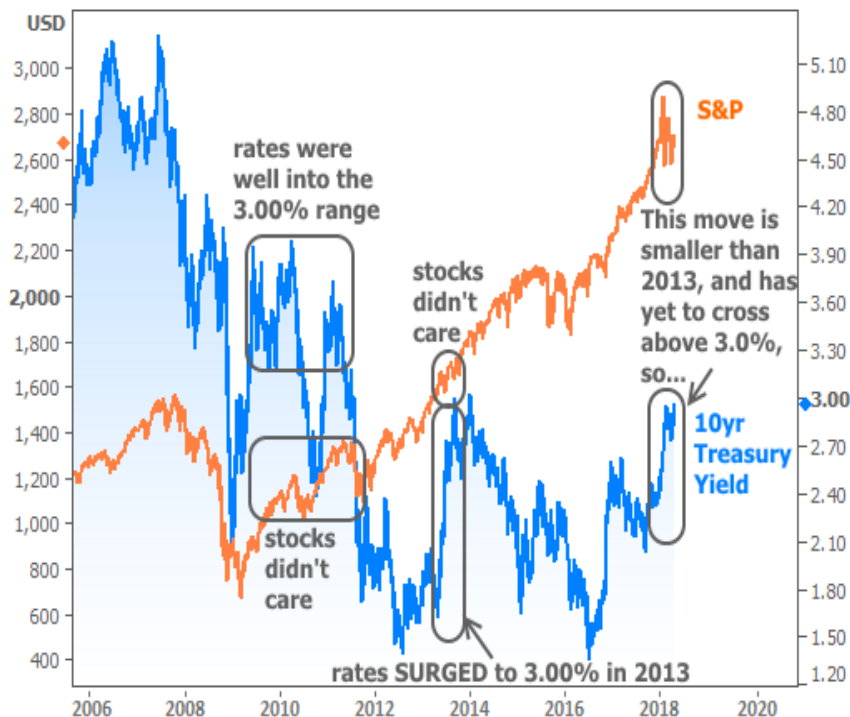
Stocks vs Bonds

How about the stock market? It was fairly tough to tune-in to financial news this week without seeing the rate spike being blamed for slumping stocks. Rather than bore you with words, I'll just leave the following chart right here ( conclusion: stocks didn't care about 3% 10yr Treasury yields in the past, nor did they care about a much bigger rate spike in 2013):